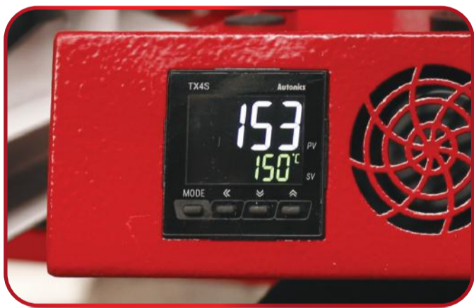
Digital temperature controls