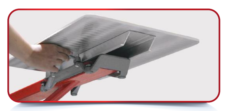
Slide-style pallet system for easy adjustment and changeover