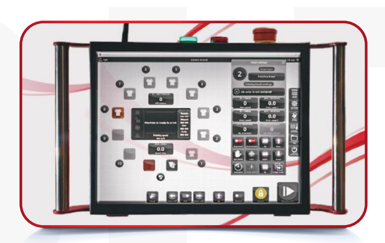
15" industrial-grade touchscreen monitor