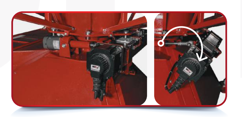
High quality servo indexer for smooth, quiet rotation at even the highest production speeds, as well as free wheel capability for manual rotation