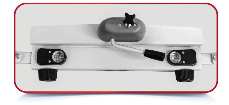
Easy-to-read micro-registration targets with lenses for protection and magnification (NEW FEATURE)