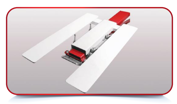
Double Sleeve Pallet (Sold Separately)