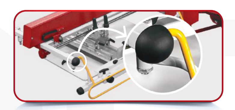
Smash button helps prevent misprints