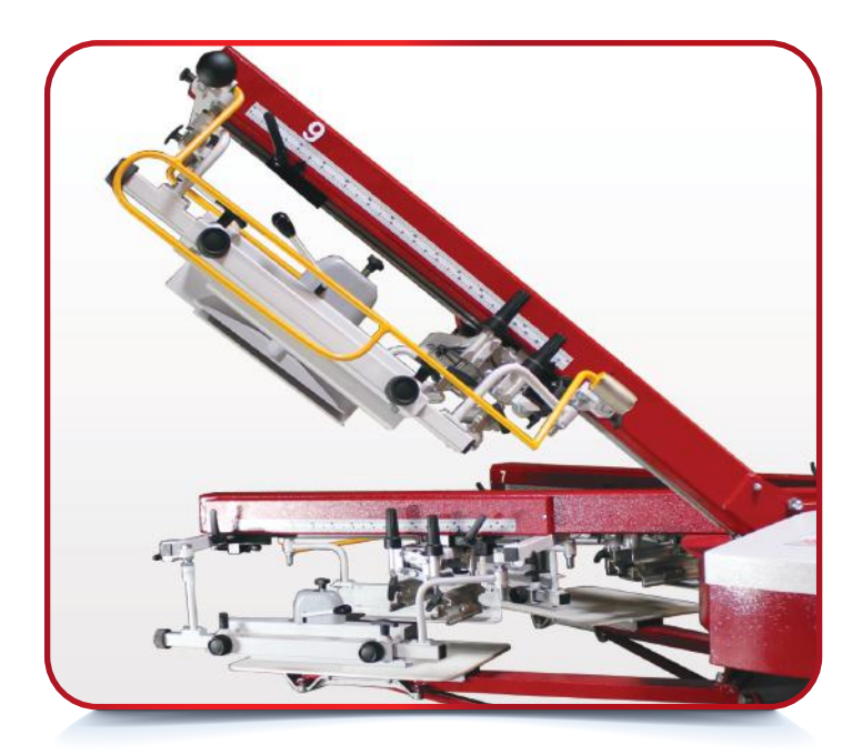
Heads Up Feature