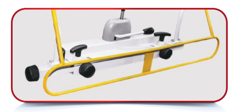
Industry-leading safety bars ensure safe set-up and operation