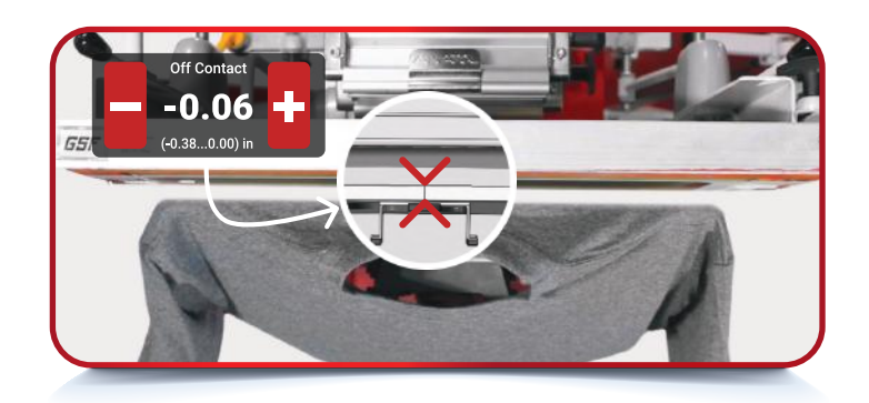
Digital off-contact adjustment right from the touchscreen control panel

Digitally-controlled central off-contact with 38 settings up to 2/5", adjustable right from the machine's touchscreen