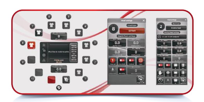
Intuitive Aries 2 operating system