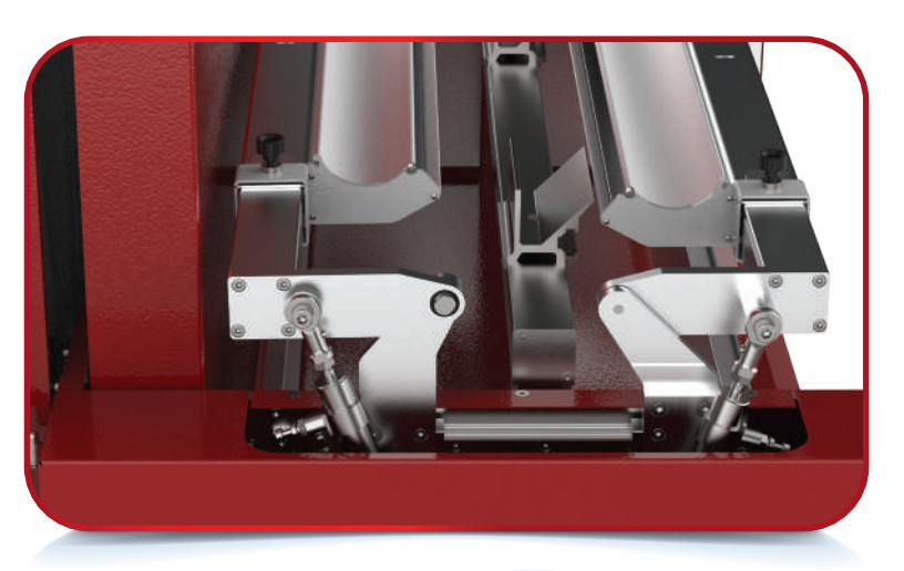
Uniform scoop coater pressure ensures a smooth, even coating of emulsion on the screen