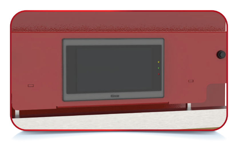
User-friendly touchscreen control panel

• Save and recall up to 15 different programs